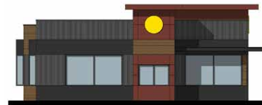
Bldg 1 South Elevation