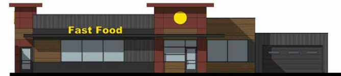
Bldg 1 East Elevation