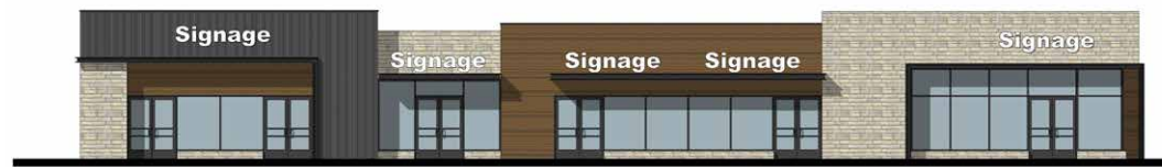
Bldg 2 South Elevation